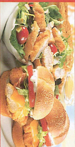
new mini chicken ranchers and fried chicken salad