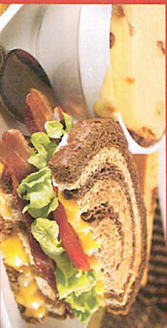
grilled cheese BLT and french onion soup